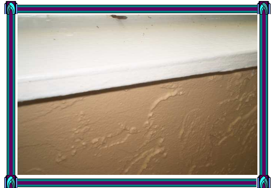
More nails through the drip edge.