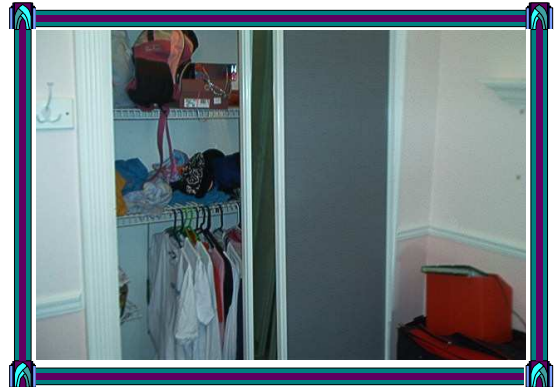
Closet door off the track in rear bedroom.