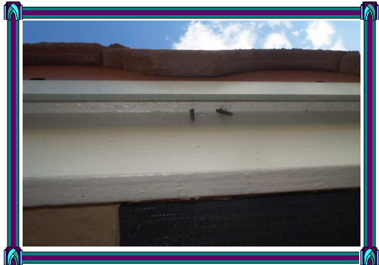
Nails that were driven through the drip edge wood.