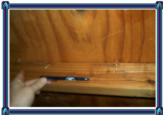
The remaining pictures are of the missed nails mentioned on the roof inspection report.