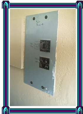
Improper panel in garage. Cover was not removed due to refrigerator.