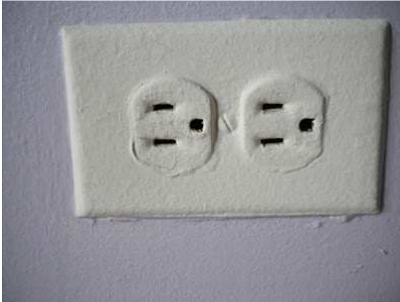
Exhibit A: This outlet, while it is white and the walls are painted purple, has in fact been painted over numerous times... Can you tell?

Here are a few pictures of the outlets, we were working with: