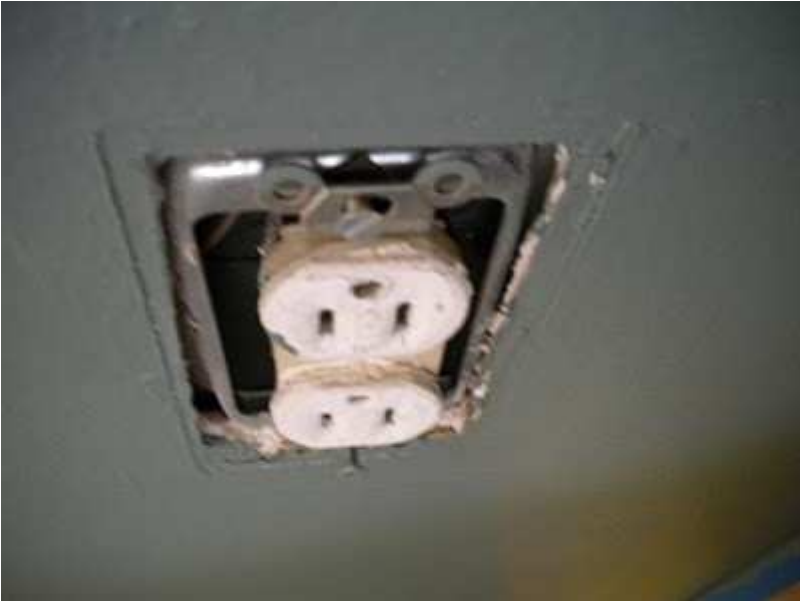
Can you see the painted caked on? Pretty Crazy!