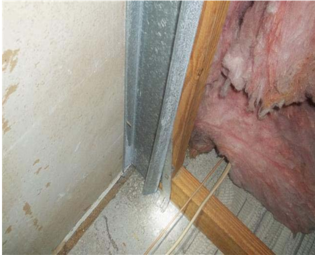
Roof to wall connection