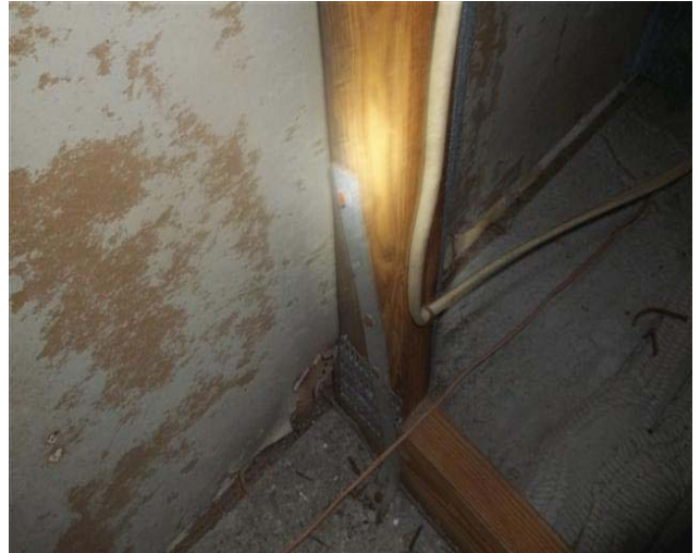
Roof to wall connection