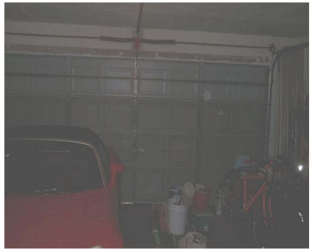
Garage door Not Rated