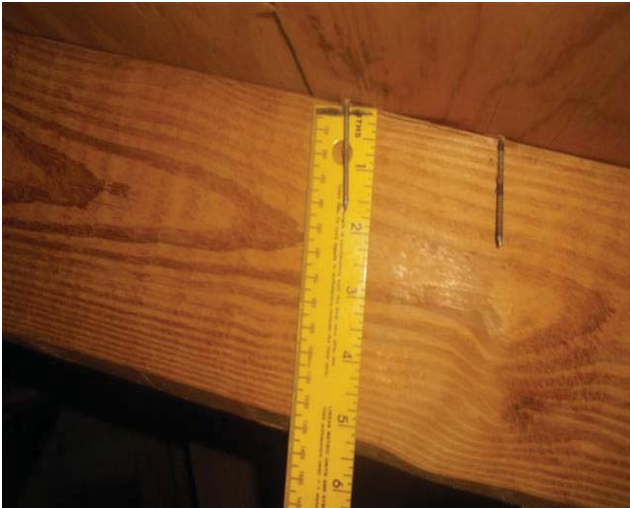
Roof deck nails 6D