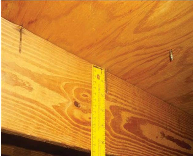
Roof deck nails 6D