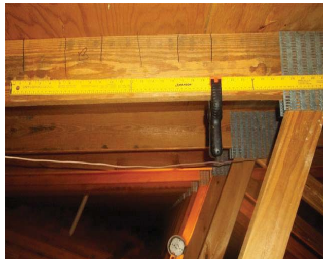
Roof decking method of attachment

Plywood/Oriented strand board (OSB) roof sheathing attached to the roof truss/rafter (spaced a maximum of 24" inches o.c.) by staples or 6d nails spaced at 6" along the edge and 12" in the field. -OR- Batten decking supporting wood shakes or wood shingles. -OR- Any system of screws, nails, adhesives, other deck fastening system or truss/rafter spacing that has an equivalent mean uplift less than that required for Options B or C below.