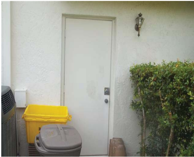
Side door garage Not Rated