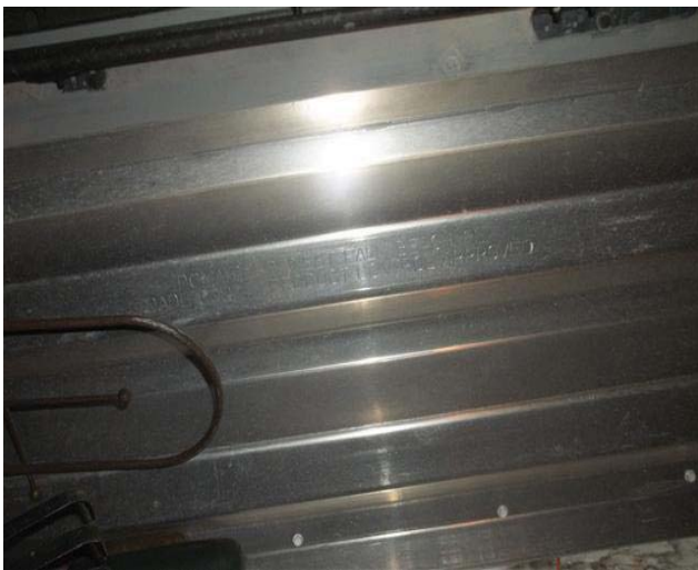
Hurricane panels Dade County Approved Permit date:6/25/1997