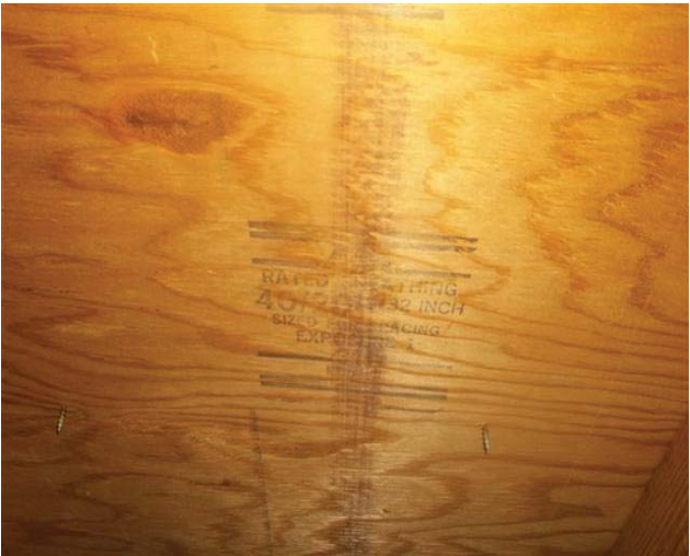
Roof decking type/ thickness