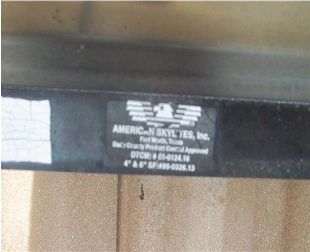
Skylight Rated NOA: 01-0124.16 Large and small missile impact