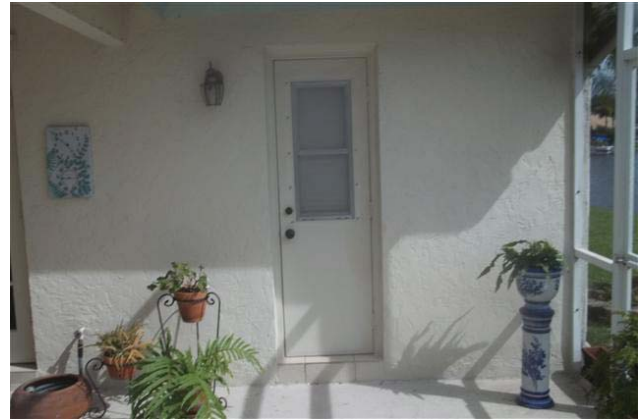
Rear bathroom door (glazed) Not protected