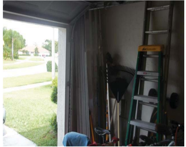
Hurricane panels Dade County Approved Permit date:6/25/1997