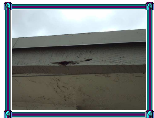
Rotted fascia observed at front of house.