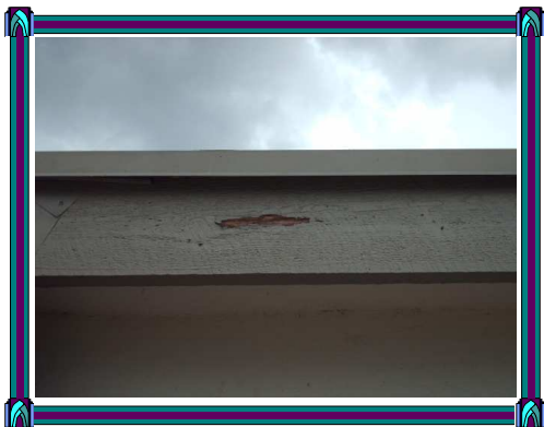
Rotted fascia at flat roof.