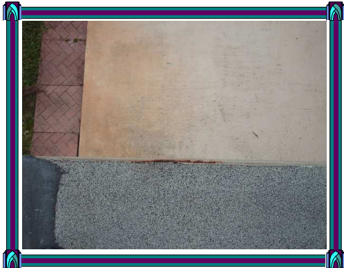
Rusted out flashing observed at flat roof.