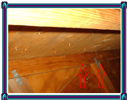
The remaining photos are of the numerous nails that have missed the roof trusses. This does not meet the APA guidelines for decking installations.