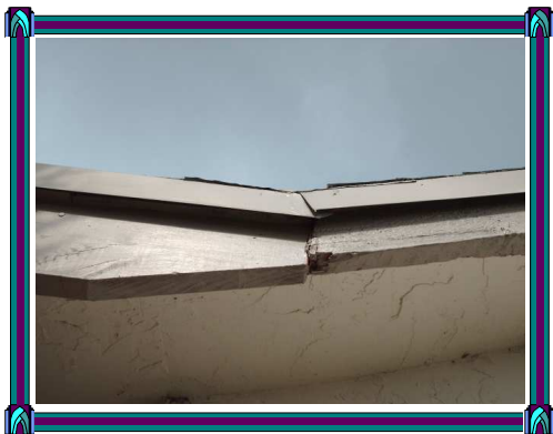
Rotted fascia observed on main roof.