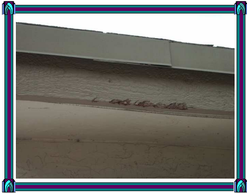
Damaged fascia observed at left side of house.