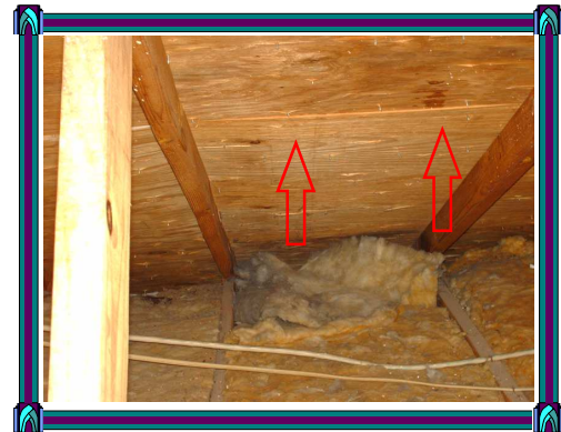
The second area of sagging plywood.