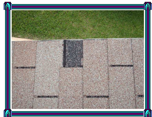
Missing shingle observed on main roof.