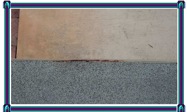
Close up of rusted out flashing at flat roof.